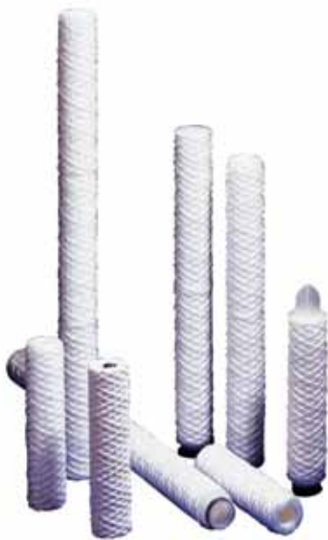
Micro-Klean™ D Series Cartridge Configurations